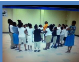
The human knot!