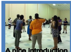
A nice introduction and welcome activity!

Summer School Enrichment Camp Aurelian Springs Campus